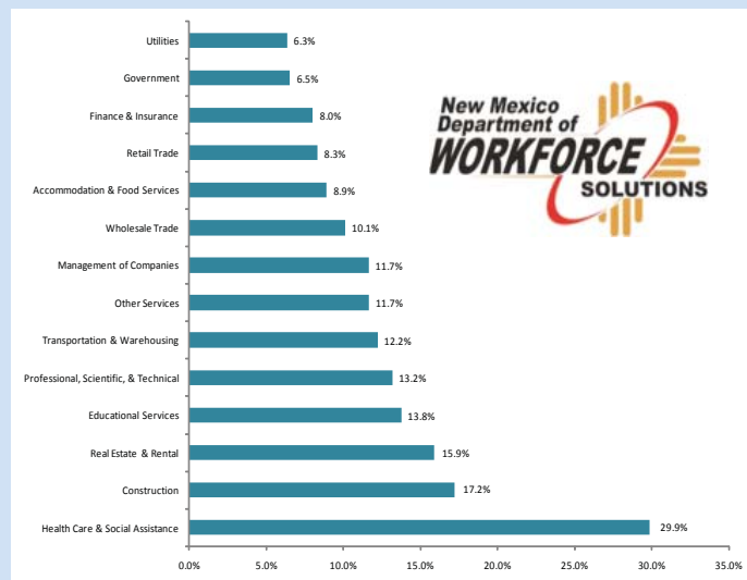
Source: New Mexico Department of Workforce Solutions, Economic Research & Analysis Bureau, 2008-2018 Projections.